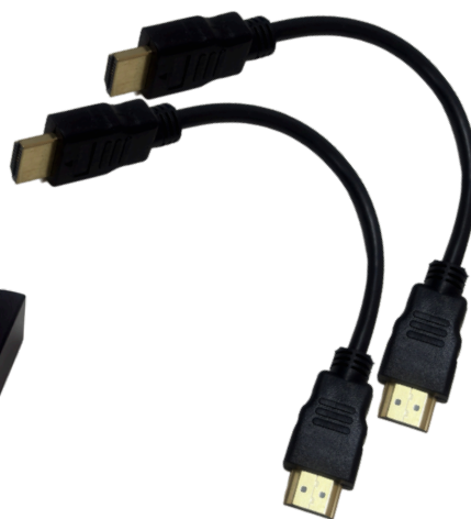
Type-C USB Cable