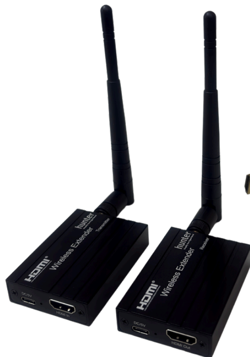
200M HDMI Wireless Extender